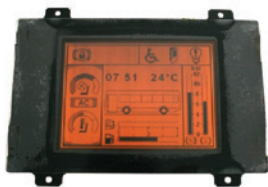
Dennis Enviro Dash Screen Replacement/Repair

Omni Tech Electronics repair or exchange on parts most popular ADL models.