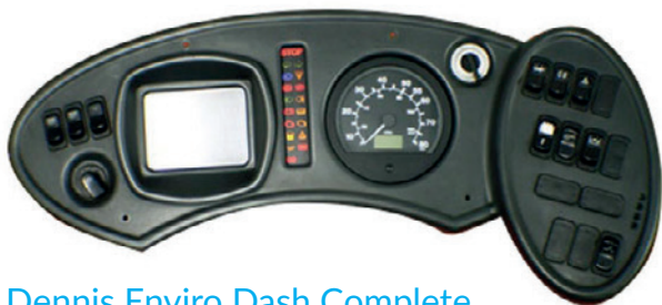
Dennis Enviro Dash Complete