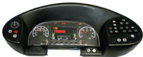
Dennis ADL Enviro 200/300/400 All parts available separately for repair